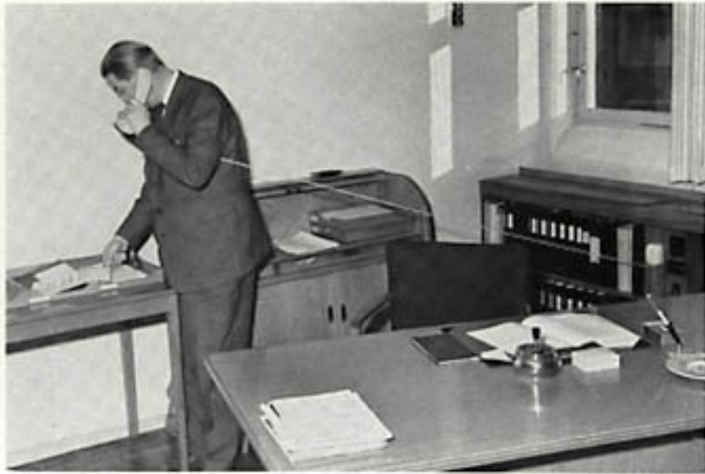
Fig. 11 X 8004 The coiled cord allows wide freedom of movement

user great freedom of movement. The remainder of the cord is straight, so as not to catch on the edge of the desk. It enters between the plastic case and the bottom frame and connects directly to terminals on the springset. The cord has only three conductors, a result of the newly developed circuit design of the Ericofon described in a separate article.