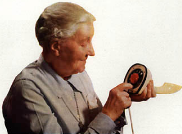
Fig. 12 The caller instinctively holds the dial at the distance best suited to the eye

For subscribers, the main value is the extreme convenience in handling the Ericofon. The placing of the dial in the handset simplifies its use in practically every situation, as proved by several years of trials with a large number of Ericofons. The dial, so to speak, comes straight into the subscriber's hand,